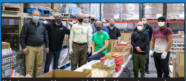
Volunteers assemble non-perishable food boxes at our warehouse on Portage Street in Kalamazoo.

We try to accommodate requests, but again, our opportunities fill up fast! If you would like to help, but we do not currently have any open spots, consider hosting a food drive at your business, church, or neighborhood. With the cancellation of the National Association of Letter Carriers' Food Drive typically held each May, our food donations are much lower than normal for this time of year.