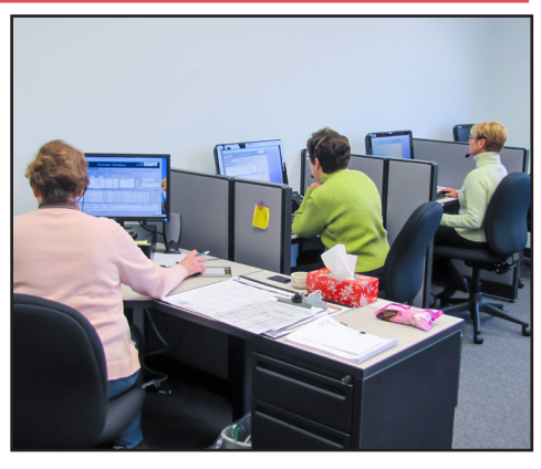
Call Center volunteers answering daily calls and scheduling pantry appointments.

Sadly, daily hunger is far more common in our community than most people realize. I was surprised to learn how many of our neighbors, including many children, do not always know where their next meal is coming from.