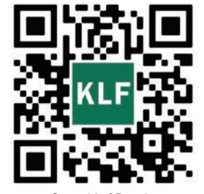
Scan this QR code with your smartphone camera to visit our website!