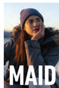
MAID 2021 Netflix original drama