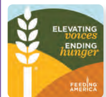
Podcast Elevating Voices, Ending Hunger