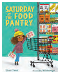
Saturday at the Food Pantry