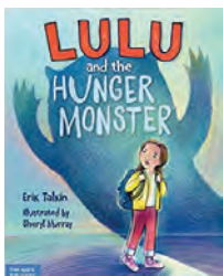
Lulu and the Hunger Monster